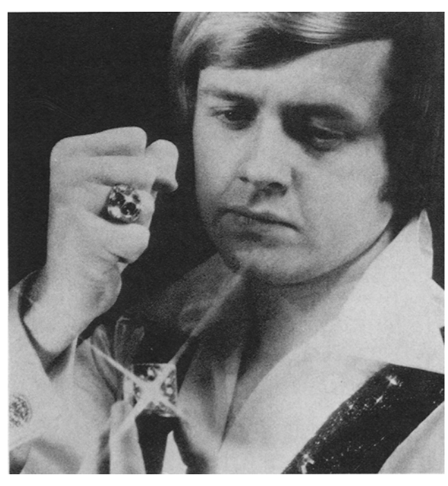
The Astonishing Neal